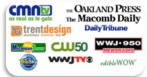
2010 Media Sponsors

MI Green Team managers have developed many media sponsorships of major events, routinely generating high-profile advertising valued in six figures. These sponsorships include major daily newspapers, network TV and radio stations, community media, leading websites, as well as targeted and general-audience magazines.