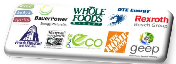
2010 Major Sponsors